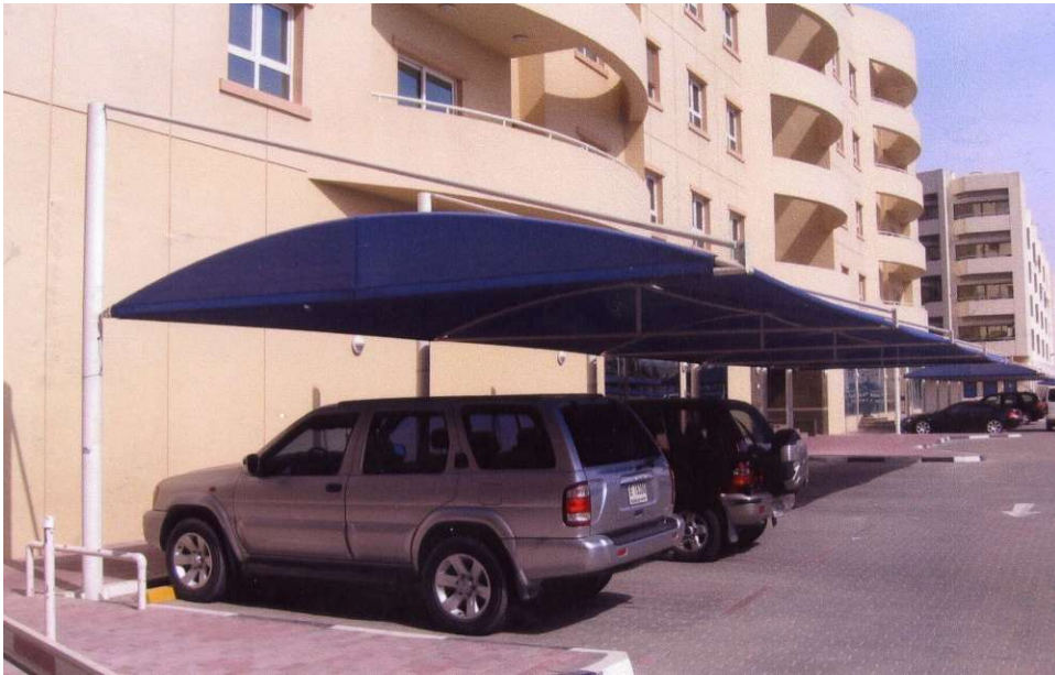
Tensile Architectural Shade Structure for Car parking area at Dubai.