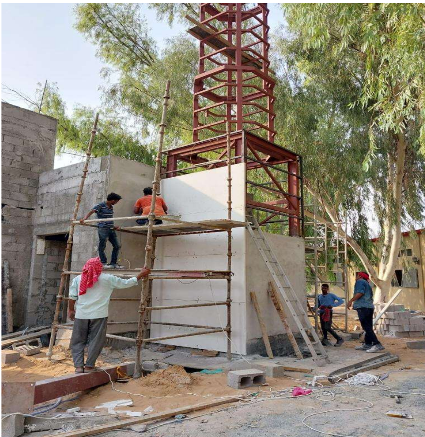
Al Zobair Mosque Sharjah