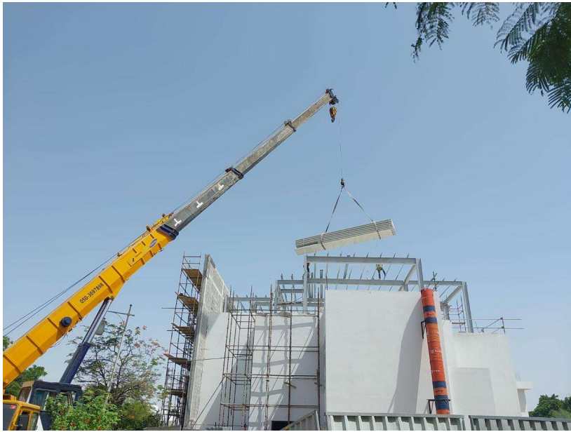
Aluminum Sandwich panel Roof and Decking Slab At villa 707- Al Barari, Dubai