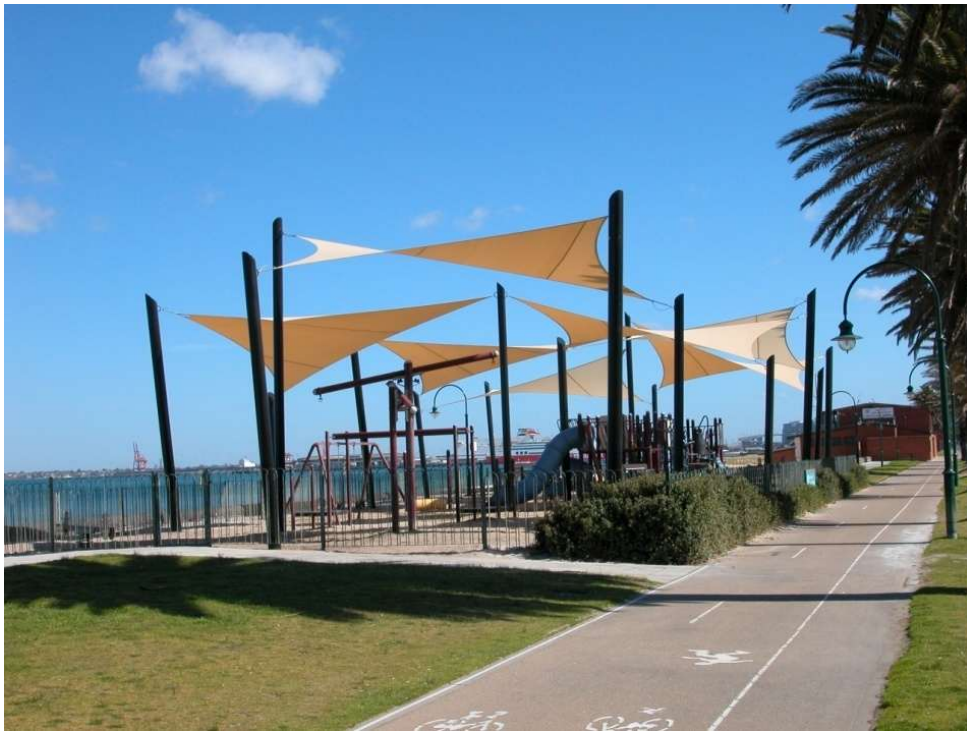
Proposed Tensile Architectural Shade Structure